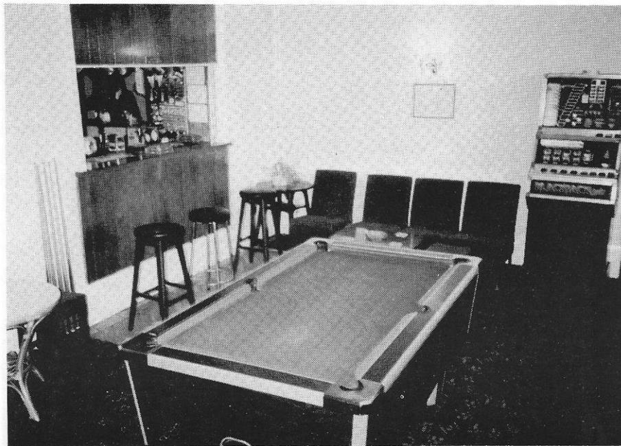
Top: Snooker Room Bottom: Front Lounge