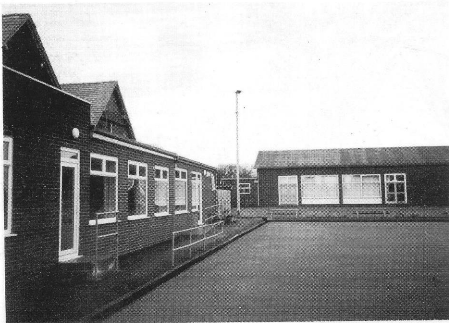
Top: Car Park and Concert Hall Bottom: View from East at rear of Club