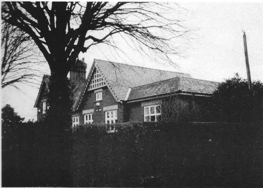
Top: Clubhouse showing Steward's House Bottom: Clubhouse from the West