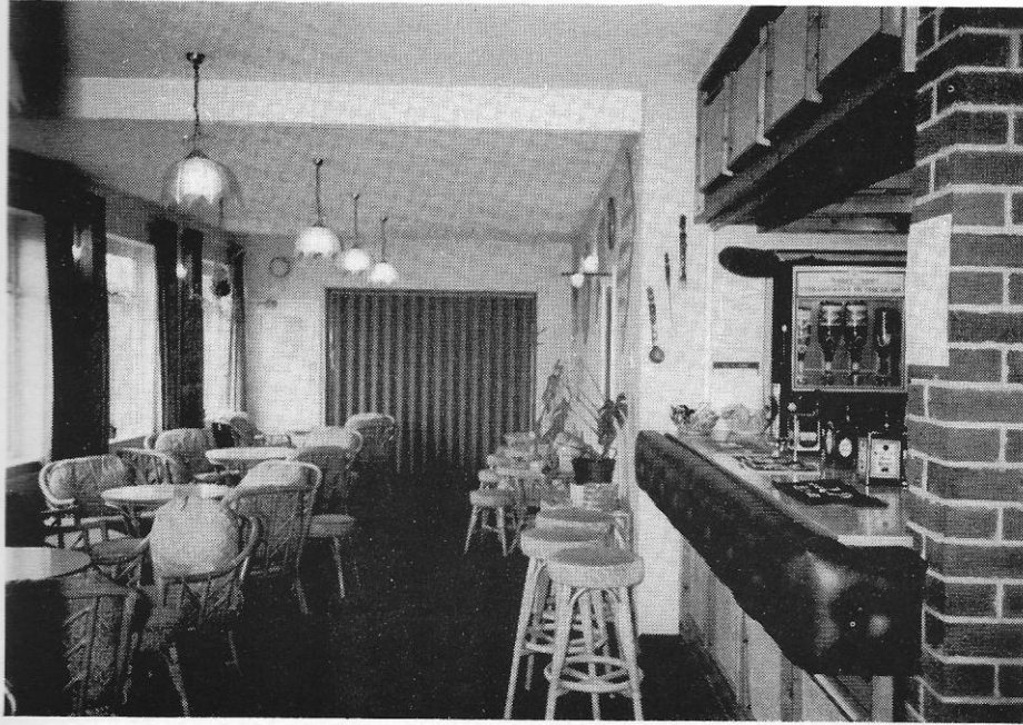
Top: Bowling Green and Tennis Courts Bottom: Verandah Lounge over-looking Bowls and Tennis